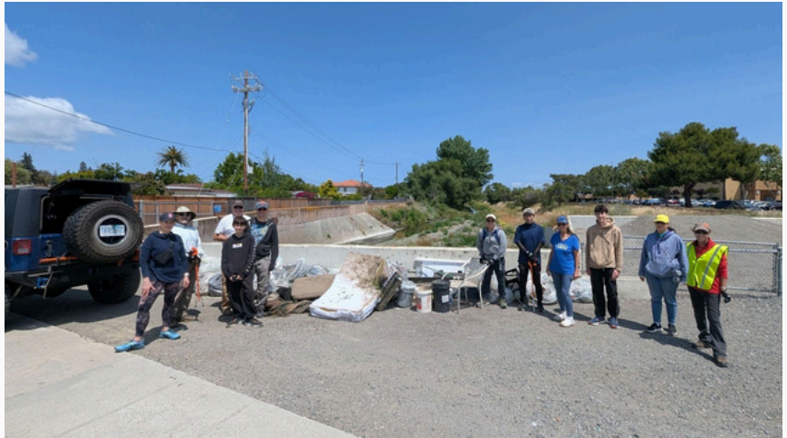
Group photo with some of our volunteers (and some of the trash too).

The National River Cleanup of Calabazas Creek between Wildwood and Tasman was another success on Saturday May 17. We cleaned both the gravel and paved trails that border the Calabazas Creek behind our neighborhood. We had 24 volunteers and picked up approximately 750 pounds of trash including some interesting items like a snowboard, purse and a mop bucket. Thank you to all the volunteers that made this event a success!