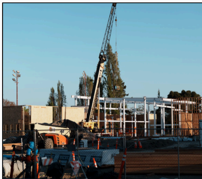
Lakewood Branch Library construction in progress

Stay tuned for more updates as this exciting project unfolds!