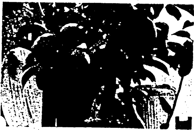
Every family in America can now grow their own Big, Delicious Apples, even if their yards are small, when they plant Stark Quadruple-Life DWARF'S.