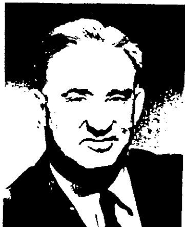
THE GENIAL IRISHMAN